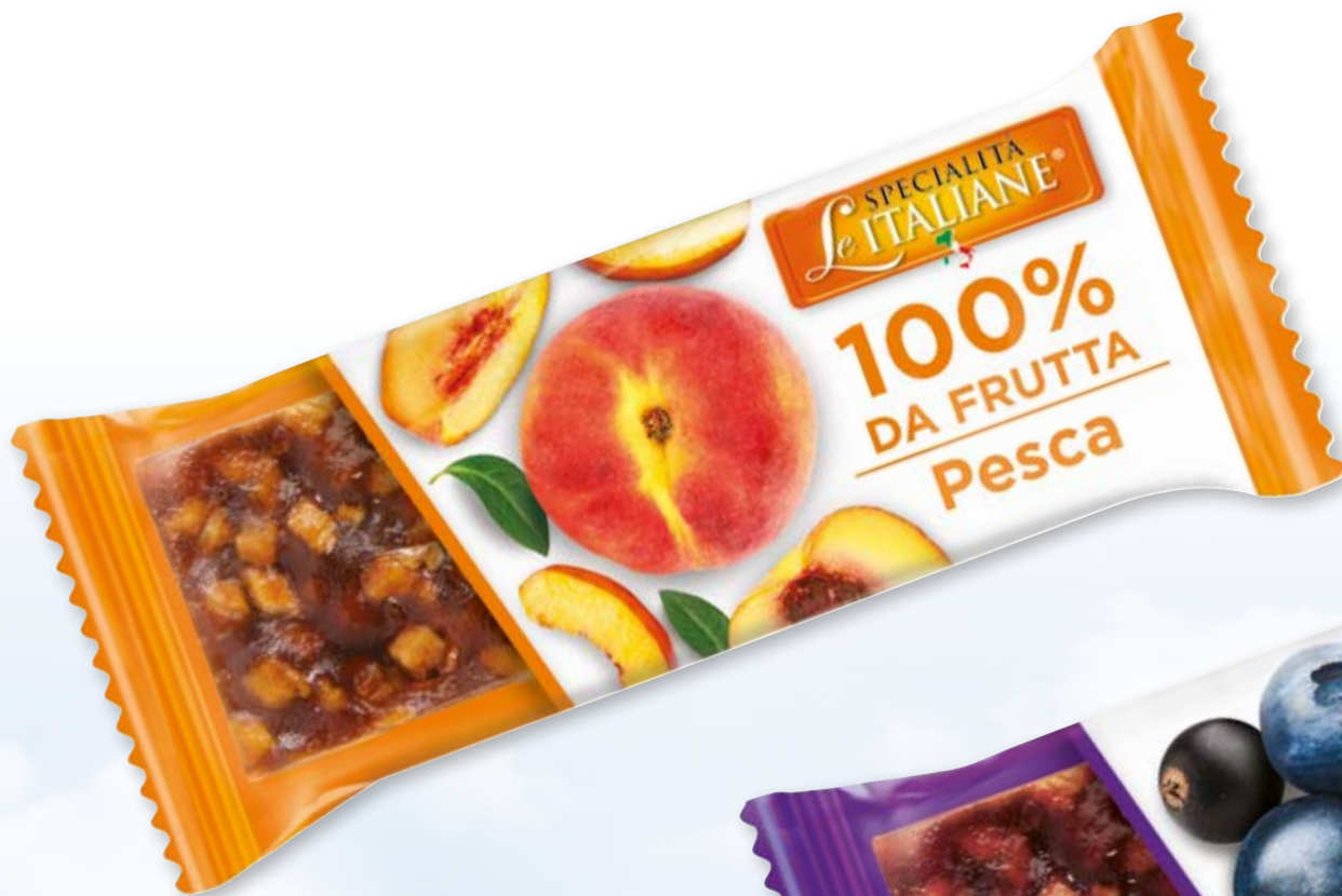
SN03 - FRUIT SNACK WITH "PEACH AND NECTARINE OF ROMAGNA PGI" AND BLOOD ORANGE JUICE 30g 8004590563039