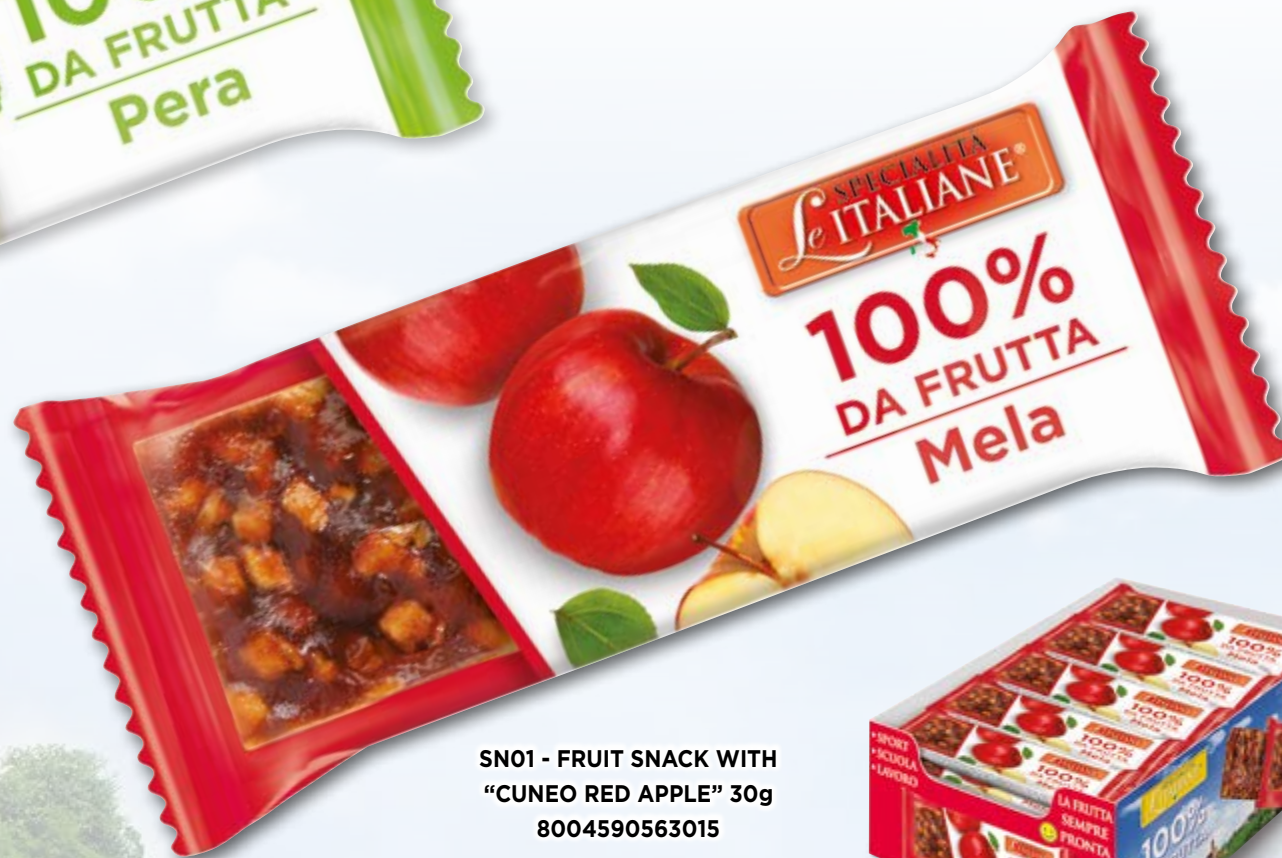
SN01 - FRUIT SNACK WITH "CUNEO RED APPLE" 30g 8004590563015