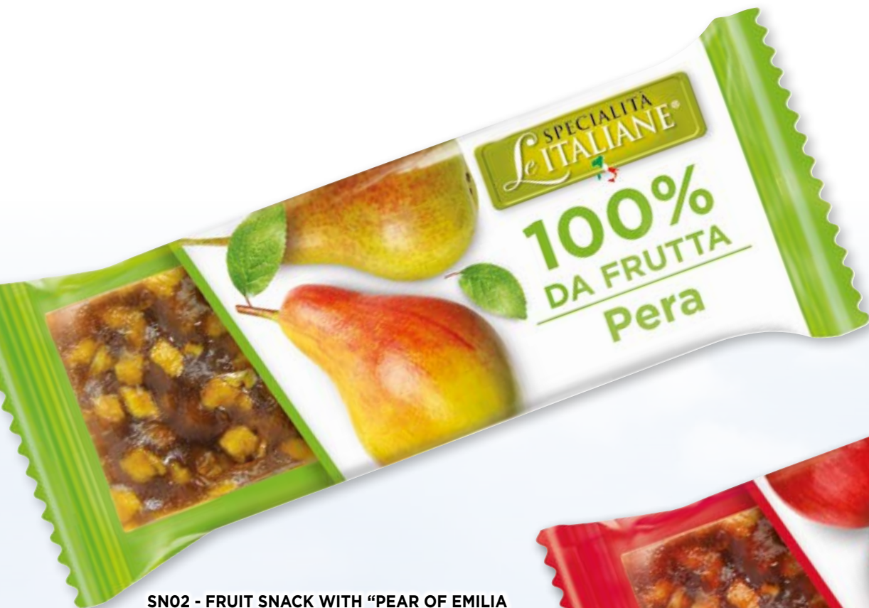
SN02 - FRUIT SNACK WITH "PEAR OF EMILIA ROMAGNA PGI" AND LEMON JUICE 30g 8004590563022