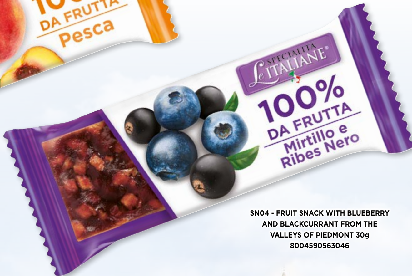
SN04 - FRUIT SNACK WITH BLUEBERRY AND BLACKCURRANT FROM THE VALLEYS OF PIEDMONT 30g 8004590563046