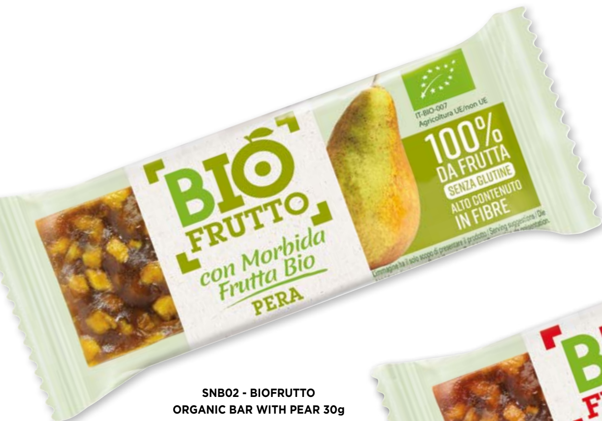
SNB02 - BIOFRUTTO ORGANIC BAR WITH PEAR 30g 8004590373027