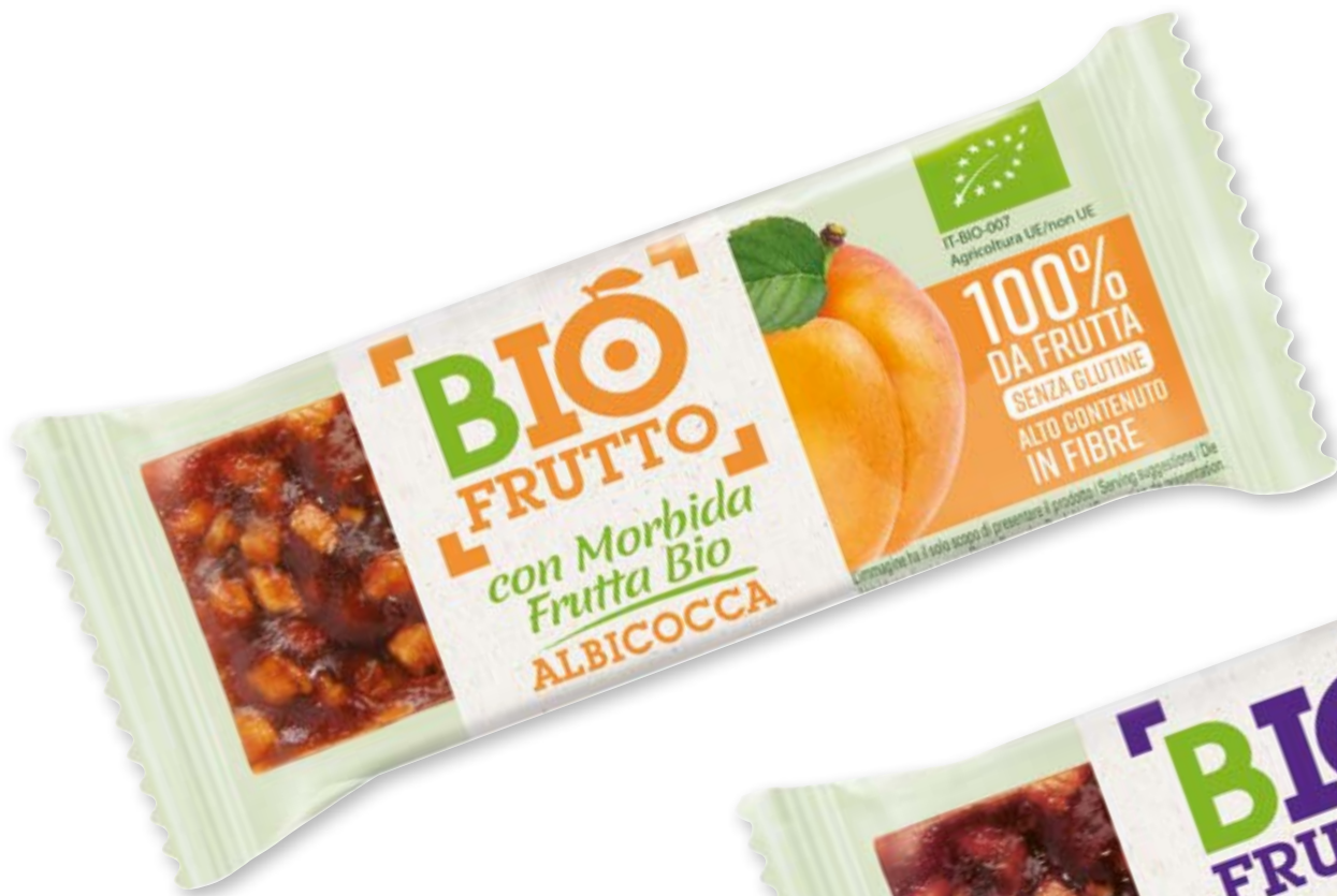
SNB05 - BIOFRUTTO ORGANIC BAR WITH APRICOT 30g 8004590373058