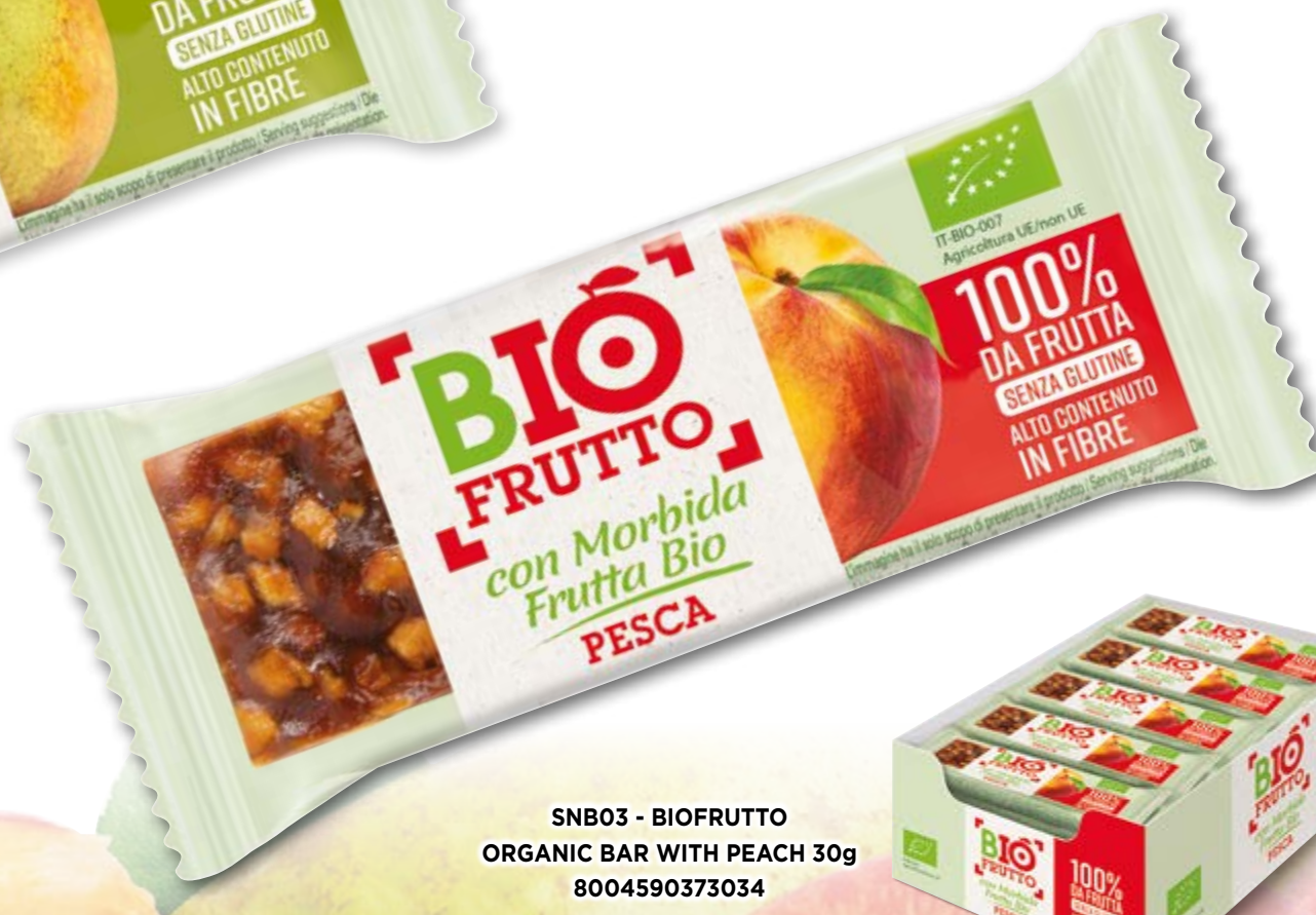
SNB03 - BIOFRUTTO ORGANIC BAR WITH PEACH 30g 8004590373034