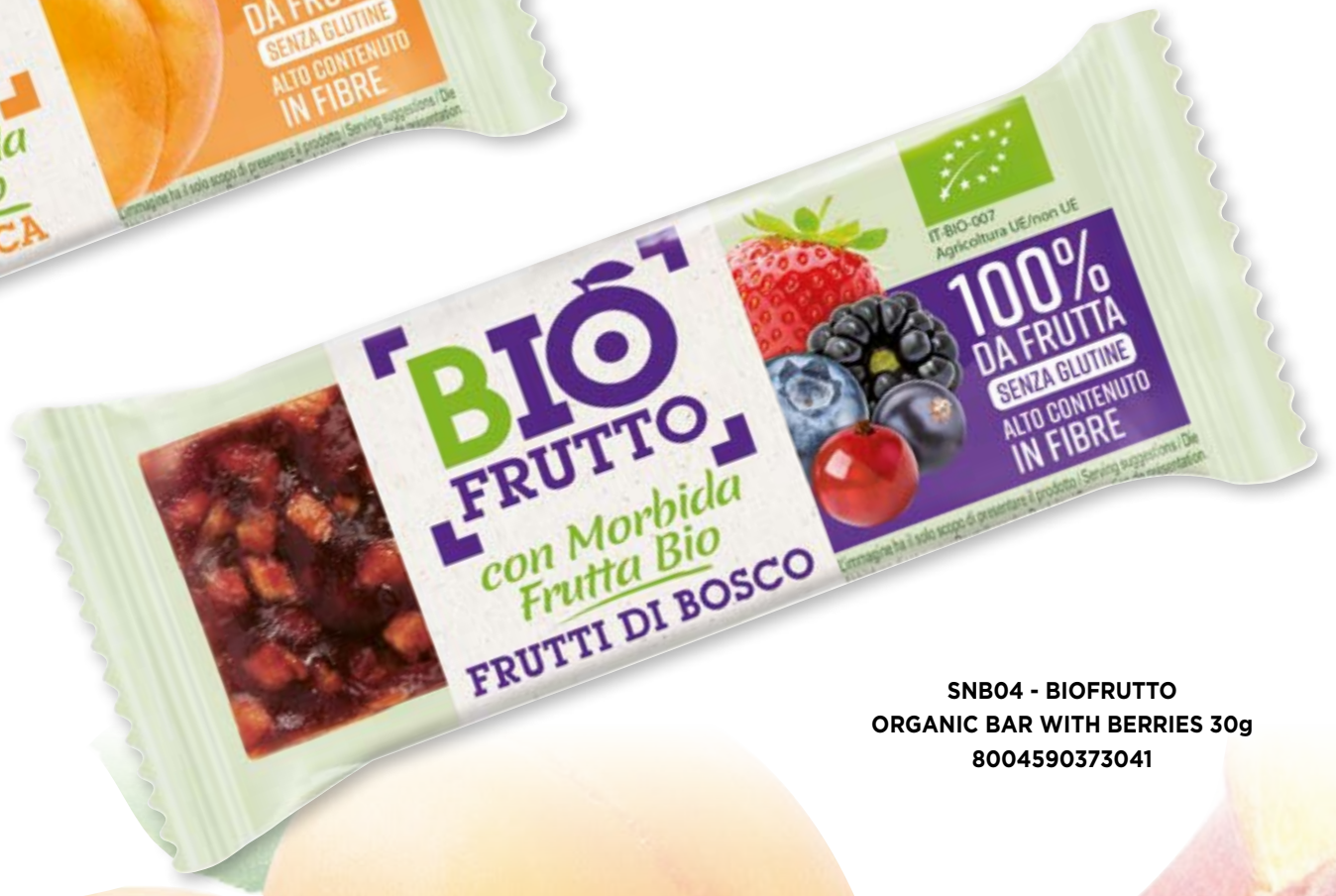
SNB04 - BIOFRUTTO ORGANIC BAR WITH BERRIES 30g 8004590373041